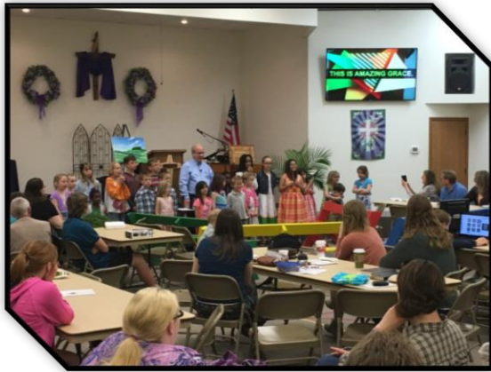
[Palm Sunday 2017 – Kids Service]