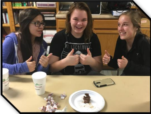
High School Youth Group Sundays @ 7:00 pm